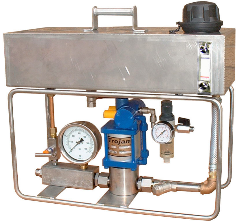
(Shown with optional Reservoir and Carrying Handle.)

Whether intended to be used as a mobile unit or installed in a permanent position the Portable Power Pack has been developed to provide a ready to use pressure testing rig.